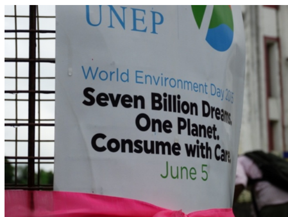
UNEP's Motto for the year 2015